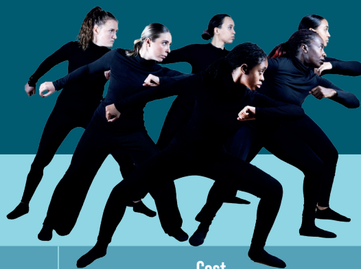
TABLE OF ACTIVITIES

https://www.riedancetheatre.org/ba-degree